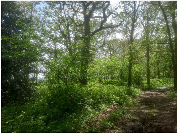
Image 2: A section of the woodland that has been successfully thinned

The team has also undertaken a degree of management of invasive laurel which is quite prevalent in several blocks through manual cutting and extraction in the compartment known as Abbey Wood, north of the formal Wall Hall Estate grounds. There has also been an effort to create a more varied and diverse woodland edge environment, particularly in the largest core compartment by means of scalloping and creation of more open areas and glades with some wildflower seeding.