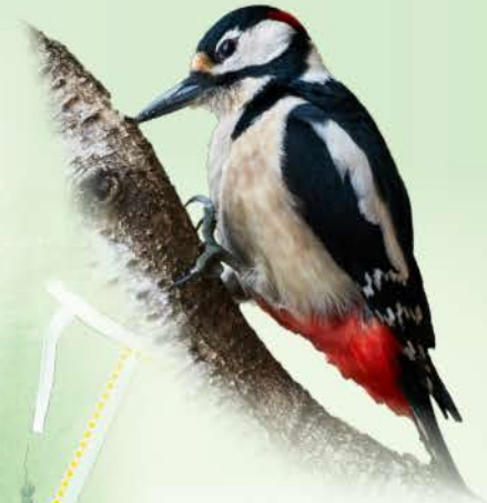
Great spotted woodpecker

You can see a wide variety of plants and animals as you explore the wood. These might include flowers like common spotted orchid and enchanter's nightshade, butterflies such as white admiral and silver-washed fritillary and birds including woodcock, nuthatch and great spotted woodpecker.