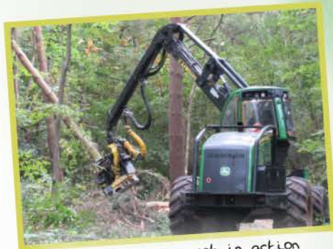
Woodland management in action

The long history of the woodland has shaped what can be found here today. Traditional management included hazel coppice and wood pasture. Areas of coppice still remain, and the leaves and nuts of the hazel have been adopted as the logo for Bishop's Wood.